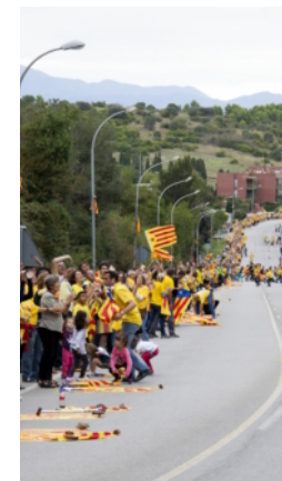
The Catalan Way

Almost 2/3 of the Catalan Parliament have agreed on holding a referendum