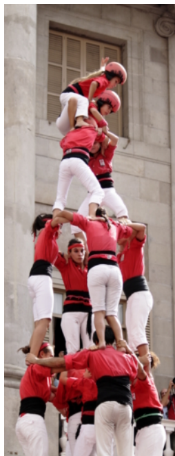
The castells are human towers