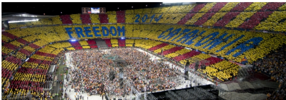
The concert for freedom

Democracy and the right to self-determination for peoples are basic, general principles of international law. But unlike the UK stance on Scotland, the Spanish Government rejects this out of hand, hiding behind the Spanish constitution, even though the Catalan government has pointed out 5 ways of holding a legal referendum in Catalonia and calls on dialogue to be able to do so. Democracy versus Constitution? It's simply a political obstacle.